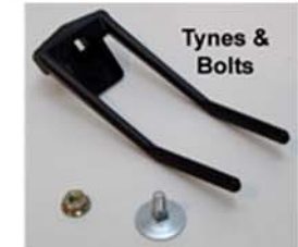
Tynes & Bolts